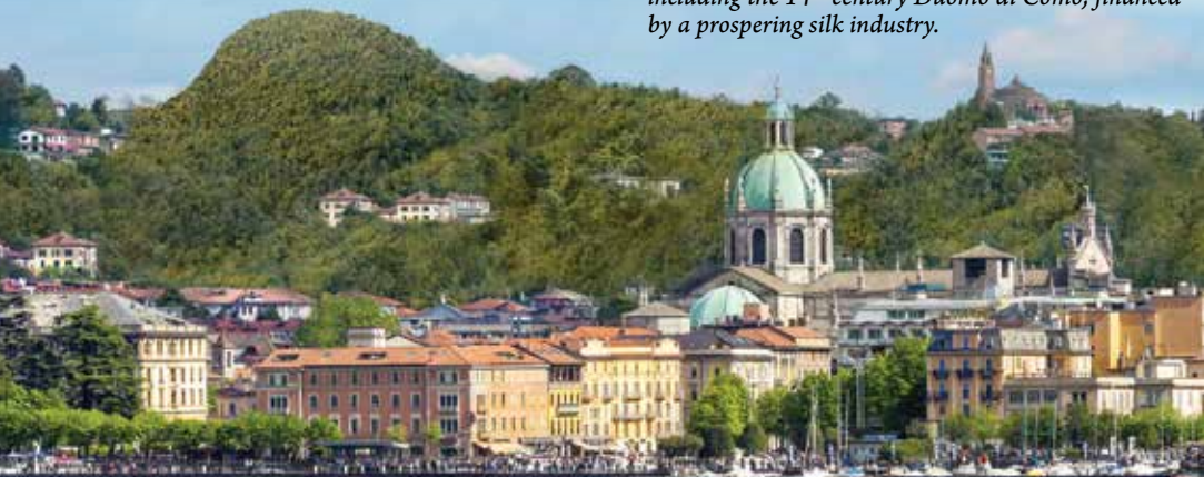
Photo below: Enjoy Como's world-class architecture, including the 14 th -century Duomo di Como, financed by a prospering silk industry.

Photo above: The Teatro Massimo boasts the extravagant beauty of the Isola Bella gardens.