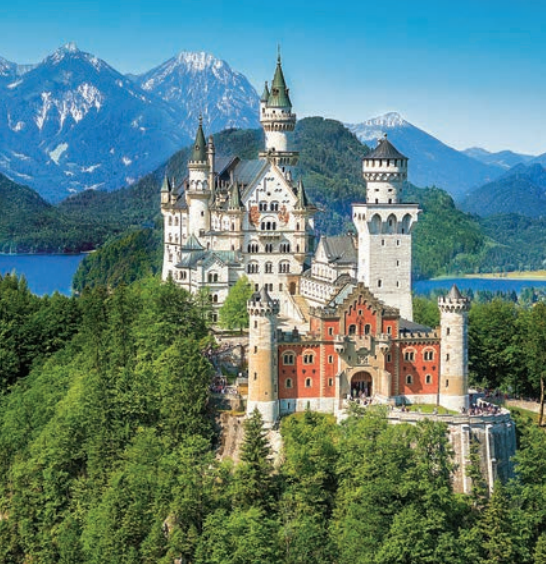
Admire enchanting Neuschwanstein Castle, built by King Ludwig II of Bavaria in 1886.

RESPONSIBILITY: Gohagan & Company, the sponsoring associations/organizations, and its and their employees, shareholders, subsidiaries, affiliates, officers, directors or trustees, successors, and assigns (collectively "Gohagan"), do not own or operate any entity which is to or does provide goods or services for your trip including, for example, lodging facilities, airline, vessel, or other transportation companies, guides or guide services, local ground operators, providers or organizers of optional excursions, food service or entertainment providers, etc. All such persons and entities are independent contractors. As a result, Gohagan is not liable for any negligent or willful act or failure to act of any such person or entity or of any other third party.