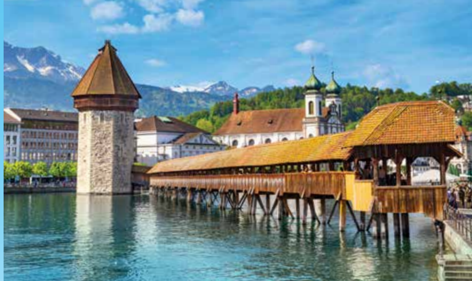
die Brücke and