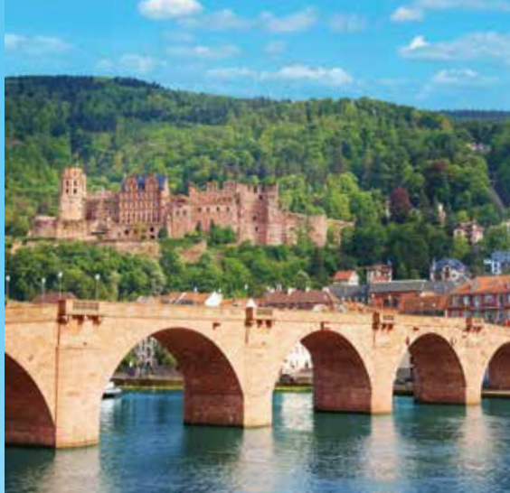
Visit medieval Heidelberg Castle overlooking 18 th -century Altstadt Heidelberg's Old Town, where Mark Twain once lived.

Visit Switzerland's capital, Bern, and enjoy lunch in a former 18 th -century High Baroque-style granary, today a traditional Bernese restaurant. Tour its beautifully preserved Old Town, a UNESCO World Heritage site framed by its signature 15 th -century arcades and the Aare River.