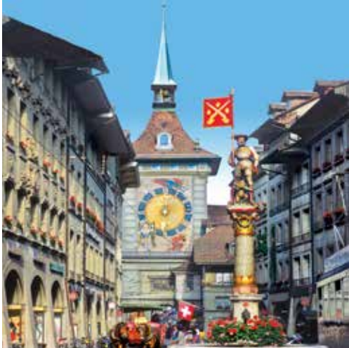
See the medieval Zytglogge, the 13 th -century tower with an ornate 15 th -century astrological clock, in Bern's Old Town, a UNESCO World Heritage site.