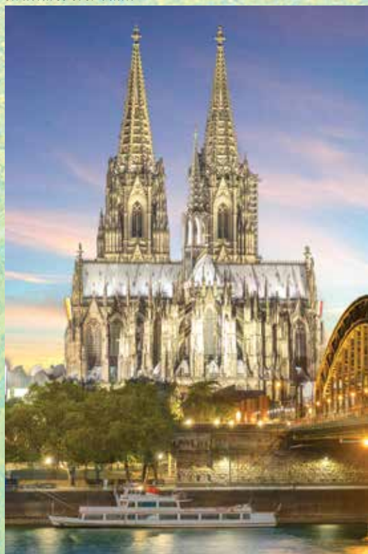
Towering spires crown Cologne's majestic Kölner Dom (Cologne Cathedral), one of the finest Gothic structures ever built.

Following breakfast, disembark the ship and continue on The Golden Age of Amsterdam Post-Program Option or depart for Canada.